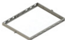
GRE.R1.H20 half support for rotating grid