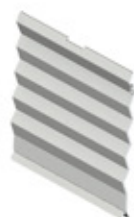
GRE.R1.C20 dividing plate