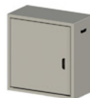
RE.R1.U10 support for two gas bottles