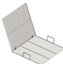
GRE.R1.J10 double grid