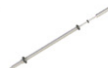
GRE.R1.V30 mini meat spit