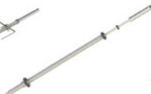
GRE.R4.M10 meat spit