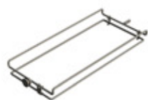
GRE.R1.K10 grid for rib