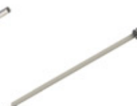
GRE.R1.M20 half meat spit