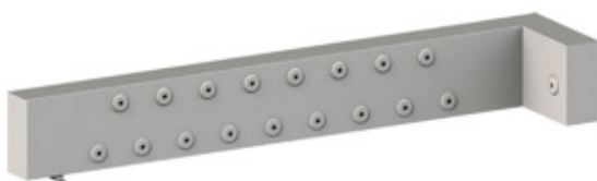
GRE.R1.V10 module rotation