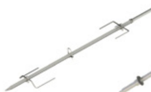
GRE.R4.P10 pork roasting spit