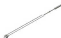
GRE.R1.V40 mini double spit