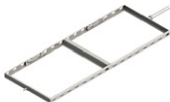
GRE.R1.H10 support for rotating grid