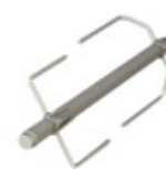
GRE.R1.T10 half pork roasting spit